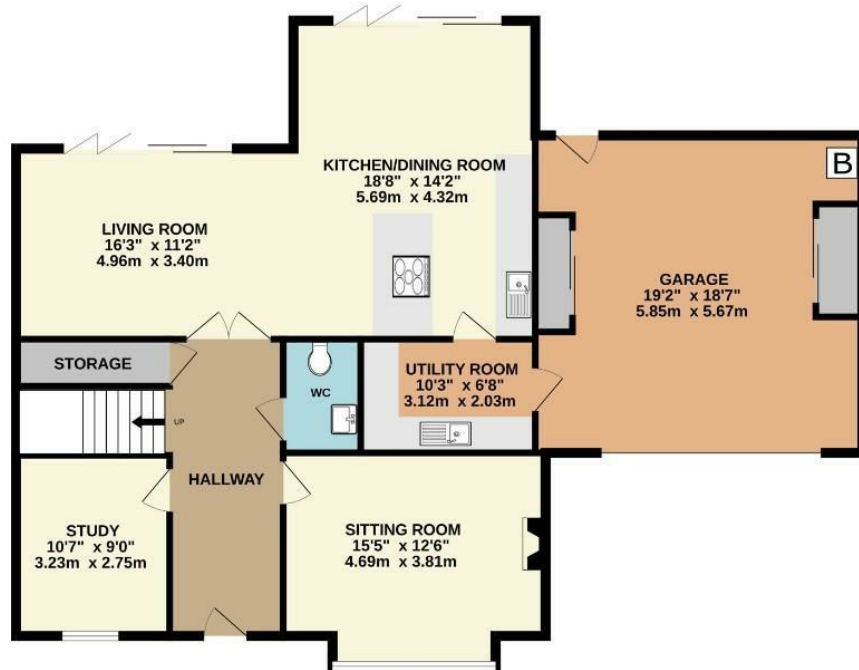
GROUND FLOOR 1353 sq.ft. (125.7 sq.m.) approx.